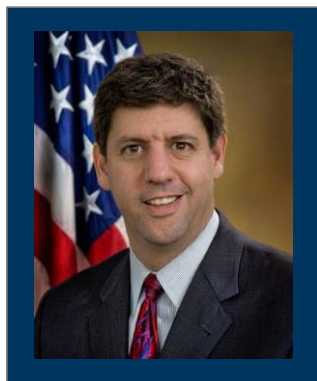
Steve Dettelbach (D)