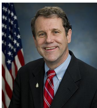
Senator Sherrod Brown (D)