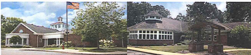
NORTH RIDGEVILLE BRANCH 35700 Bainbridge Road • North Ridgeville, OH 44039 440-327-8326