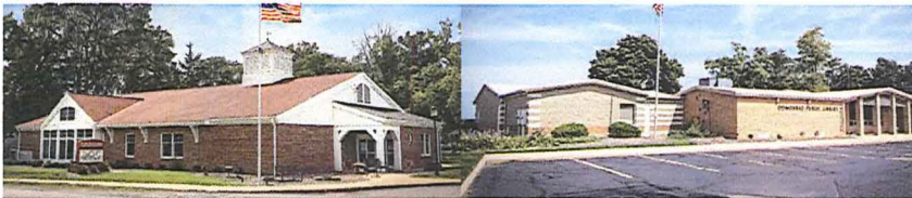
COLUMBIA BRANCH 13824 W. River Road North Columbia Station, OH 44028 • 440-236-8751