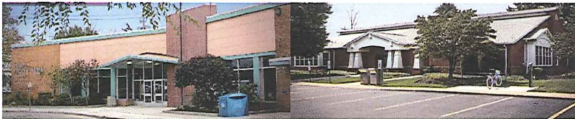
MAIN LIBRARY 351 W. Sixth Street • Lorain, Ohio 44052 440-244-1192